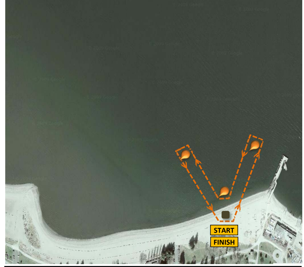
2KM SUP TECHNICAL (2 x 1KM lap)