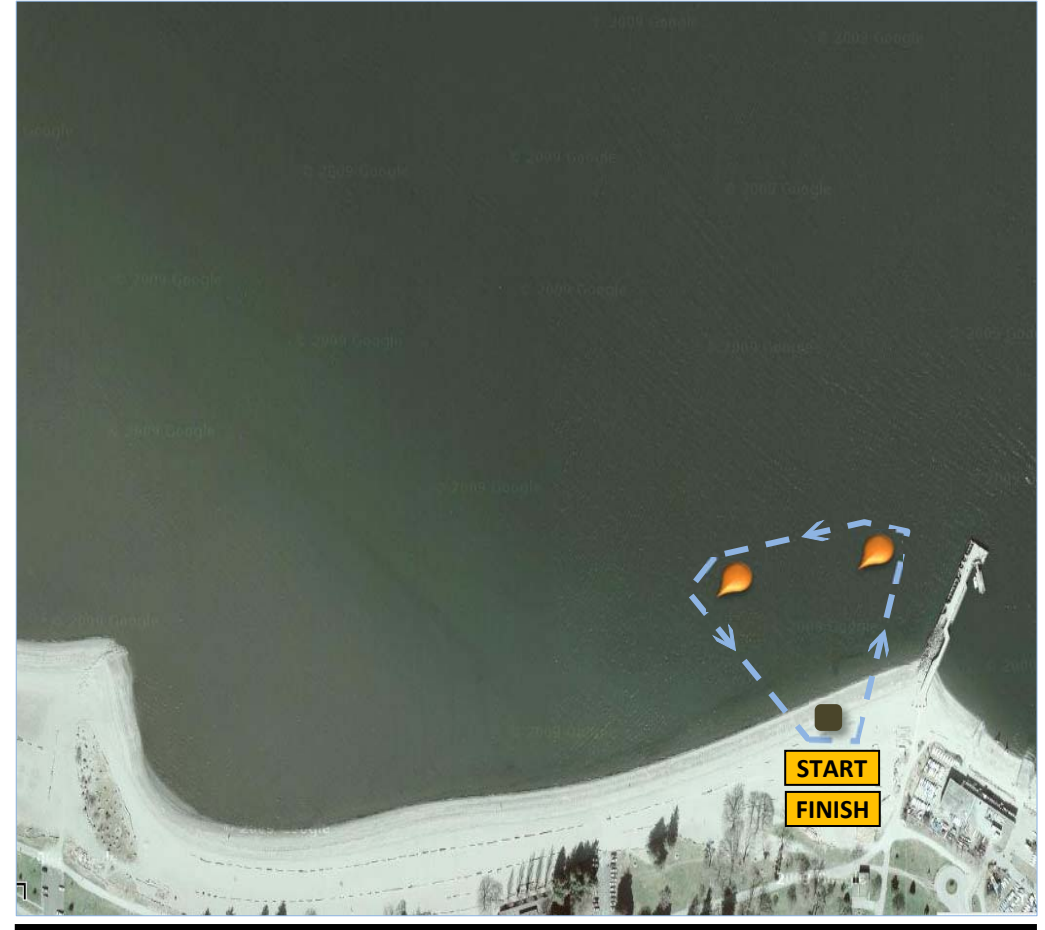
PRONE RELAY 3 person (3 x 500m)